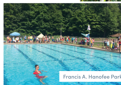
Francis A. Hanofee Park

Rail Trails – Miles of the historic Ontario and Western Rails (O & W Rail Trail) are located in the Town of Liberty which allow for safe hiking, biking, cross country skiing and many other outdoor activities.