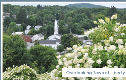
Overlooking Town of Liberty