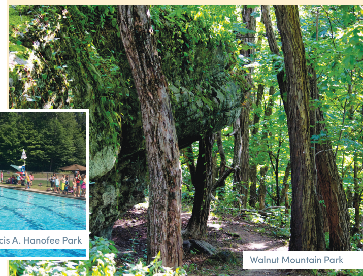
Walnut Mountain Park