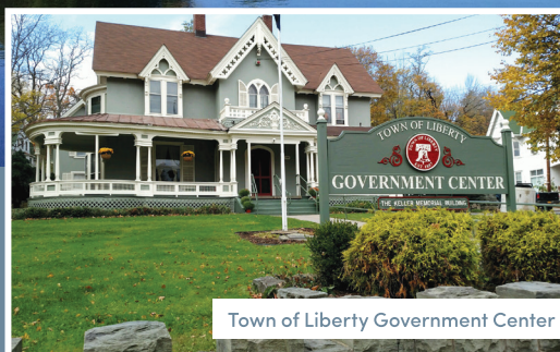
Town of Liberty Government Center

Welcome to Liberty! The Town of Liberty, in New York's beautiful Catskill Mountains, was established in 1807. Located approximately 90 miles north of New York City, Liberty has a rich history dating back to the time of the Revolutionary War. Today, with its excellent schools, outdoor recreation and its escalating business climate, the Town of Liberty is a great place to live, play and do business. Looking forward, the Town of Liberty has lots of new and exciting developments happening to uphold its commitment to the community.