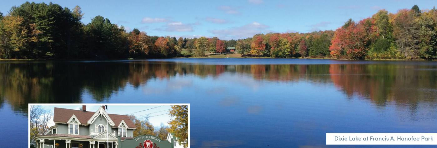
Dixie Lake at Francis A. Hanofee Park