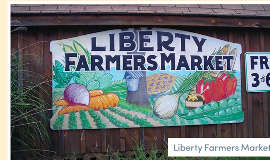
Liberty Farmers Market

Other highlights include the Historic Downtown District, Liberty Main Street Stage, Weekly Farmers Markets, and nearby are Resorts World Catskills Casino and Bethel Woods Center for the Arts. Check out our website for a full list of outdoor recreation activities at: www.townofliberty.org/departments/parks-recreation/ .